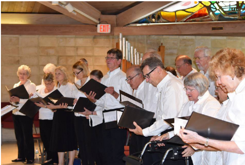
The Off Key Chorale performance held at the Unitarian Universalist Church of Sarasota